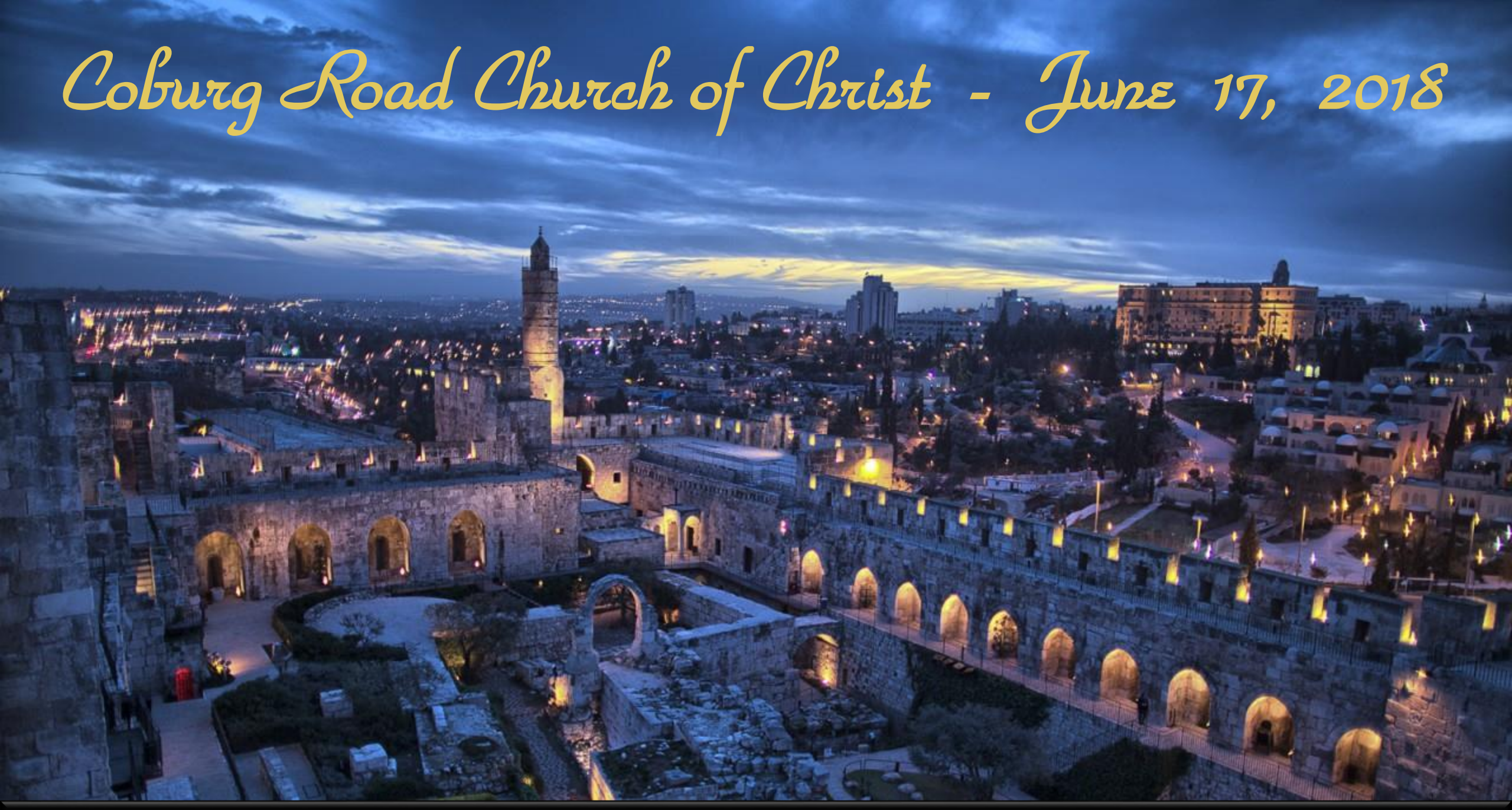
"City of David" built on foundations of Herod the Great's Palace